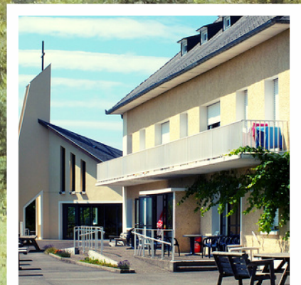
The terrace at Hosanna House