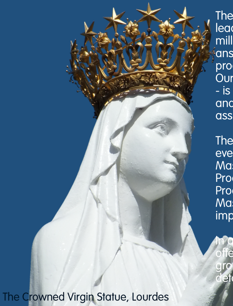
The Crowned Virgin Statue, Lourdes

In addition, the local region around Lourdes offers a host of varied attractions for your group to enjoy - see our website for more details