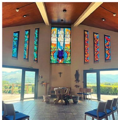
Hosanna House's Chapel