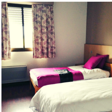
A Typical Bedroom

We have 65 years experience of providing pilgrimages to Lourdes, and our passionate and knowledgeable staff in the UK and Lourdes can provide support and advice before and during your pilgrimage.